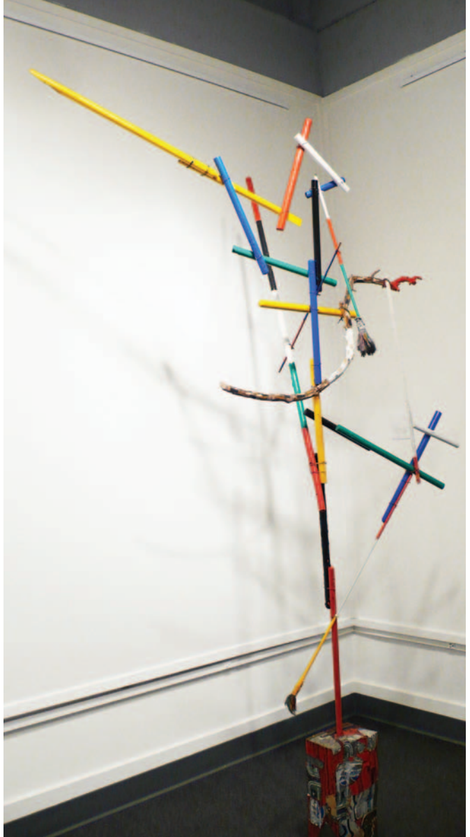
Ramos Rivera's sculpture, created between 1980 and 1985, references the "X" in "Xpresiones".

An outstanding bilingual catalogue of Ramos Rivera's 2006 retrospective was co-published by the San Jose Museum of Art and the San Jose Institute of Contemporary Art. ❖