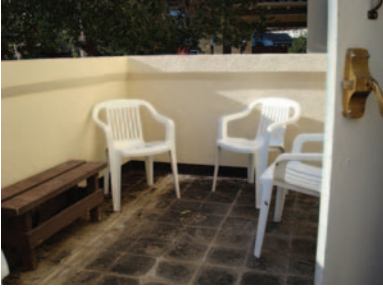
New West Terrace

Remember how warm and stuffy the Gallery gets during receptions? And how ugly the view of the side porch was when, in desperation, the emergency exit door was opened? That has changed.