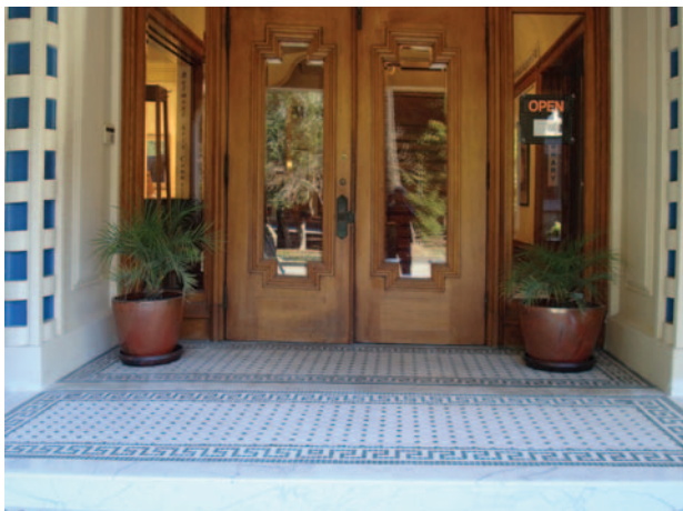
Museum front doors.

The Manor House has had a ramp for some years, but the six-inch step up to the front door was never dealt with. The solution is an enlargement of the entry area and expansion of the existing ramp so that they connect. Confusing? Come and see.