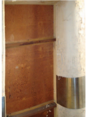
Access to Gallery from inside the walk-in refrigerator.

From bad news has come good news: the City's Public Works staff is working on conversion of the old walk-in refrigerator/freezer (at the back of the building, behind the Gallery) into two small rooms, one for storage and one for prep and maintenance. The City's restoration project architect, Ken Hall, is designing an "invisible door" for access to the back corner of the Gallery. What could be better??❖