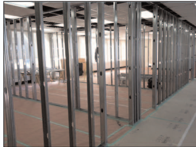
New walls go up for the Institute art studios.