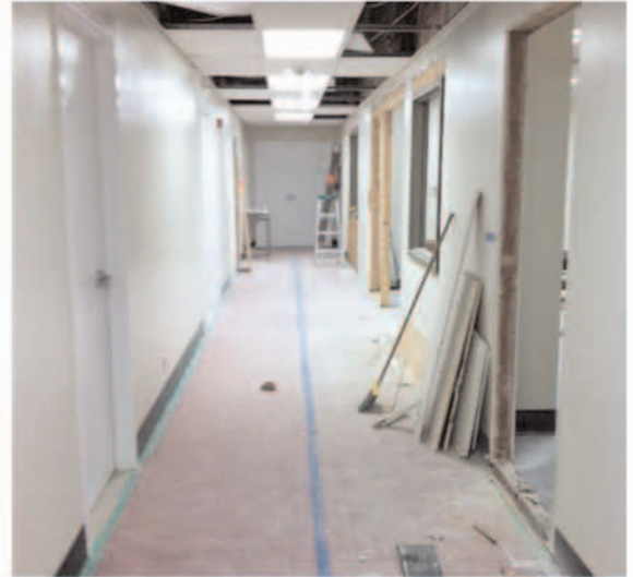
New doorways and windows have been created in the West Wing.

When construction is finished and our occupancy permit has been issued, we will have our own new address: 1777 California Drive. But please resist the urge to go peek – hazardous construction sites are for workers only, and we really don’t want to slow down progress with interruptions! Thank you . . . ❖