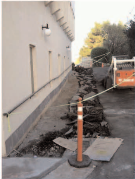
New walkway construction.